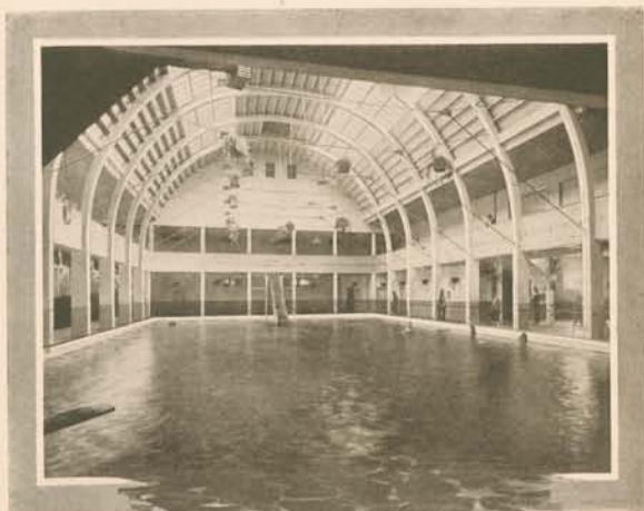
INTERIOR OF MAGNIFICENT PLUNGE