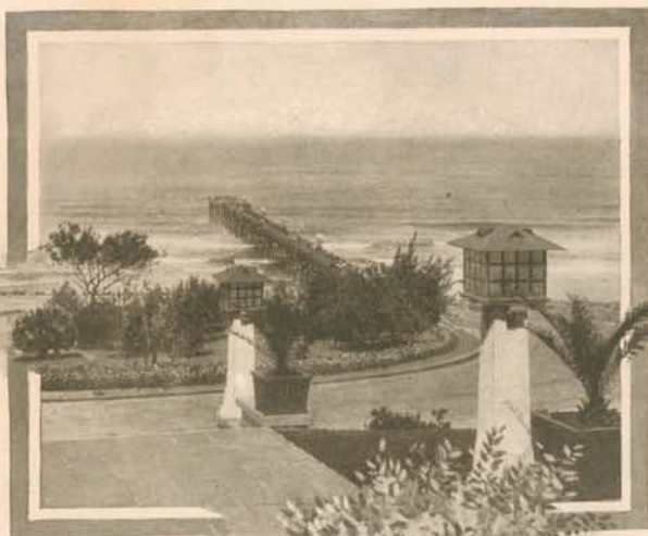
PLEASURE PIER FROM STRATFORD INN

On any round trip railroad ticket between Los Angeles and San Diego, a free stop-over privilege at Del Mar is allowed. Application for the same should be made to the conductor.