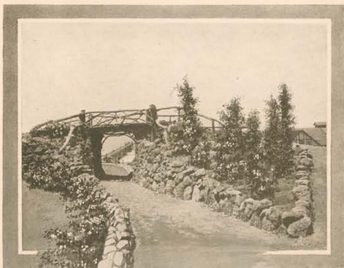
RUSTIC BRIDGE IN A CORNER OF THE SUNKEN ROSE GARDENS

STRATFORD INN, architecturally, is unsurpassed in its suitability for the location. It is like the home of the wealthy for convenience; like the home of the artist for beauty and comfort; like the home of the true American for simplicity.