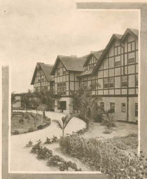
A DRIVE ENTRANCE TO STRATFORD INN THROUGH FLOWER GARDENS

STRATFORD INN, architecturally, is unsurpassed in its suitability for the location. It is like the home of the wealthy for convenience; like the home of the artist for beauty and comfort; like the home of the true American for simplicity.