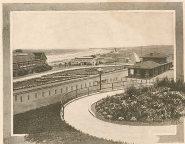
WINDING CEMENT WALK FROM STRATFORD INN TO DEPOT, GARAGE, BATH HOUSE, BEACH AND PIER