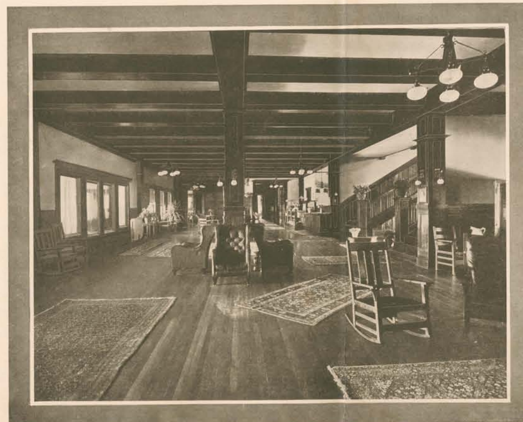
"Welcome ever smiles and farewell goes out sighing"

An attractive feature is a place on the beach or in the hills, where the youngsters can roam, romp and frolic to their hearts content without the parents' fear of danger.