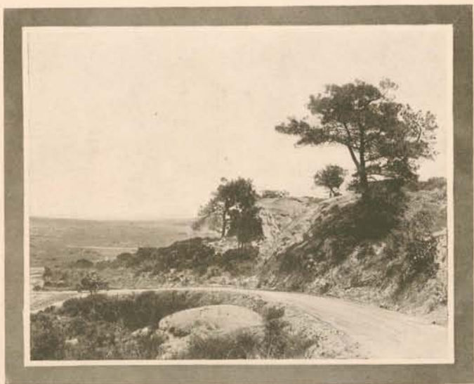
PICTURESQUE CLIFFS AND APPROACH TO STRATFORD INN

A commodious and modern garage, open day and night, and operated under the management of the STRATFORD INN, insures the best of service.