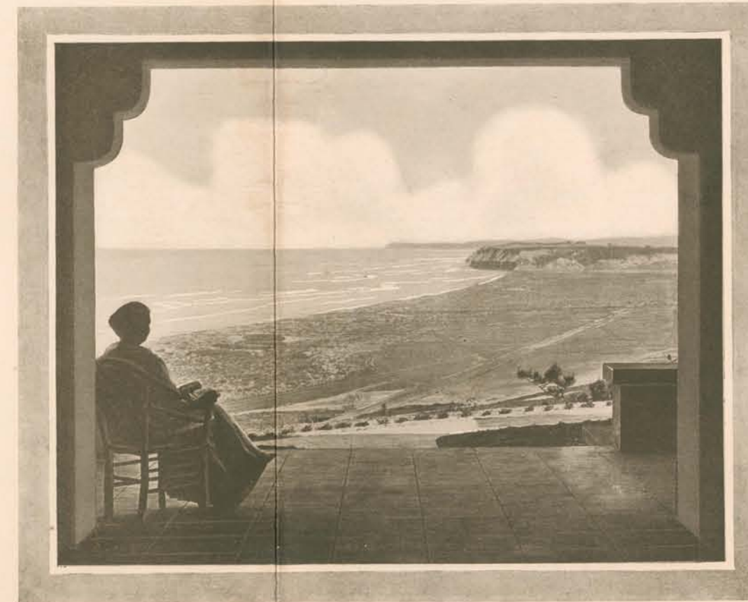
"The sweep of the white breakers of a sinuous, swinging beach."

Excellent school facilities are provided at Del Mar; also Catholic and Protestant churches.