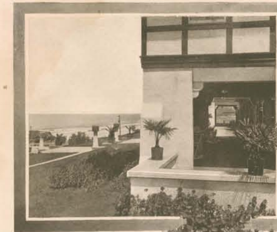
VIEW THROUGH PIAZZA ARCHES

"Palisades," "The Melting Pot," "The Point of Pines"; and this spot has a romantic interest as well as having been the scene of Bayard Taylor's classic poem, "Paso del Mar." The famous "Torrey" pine, which is absolutely unknown on the face of the earth except at Del Mar, is a remnant of prehistoric ages.