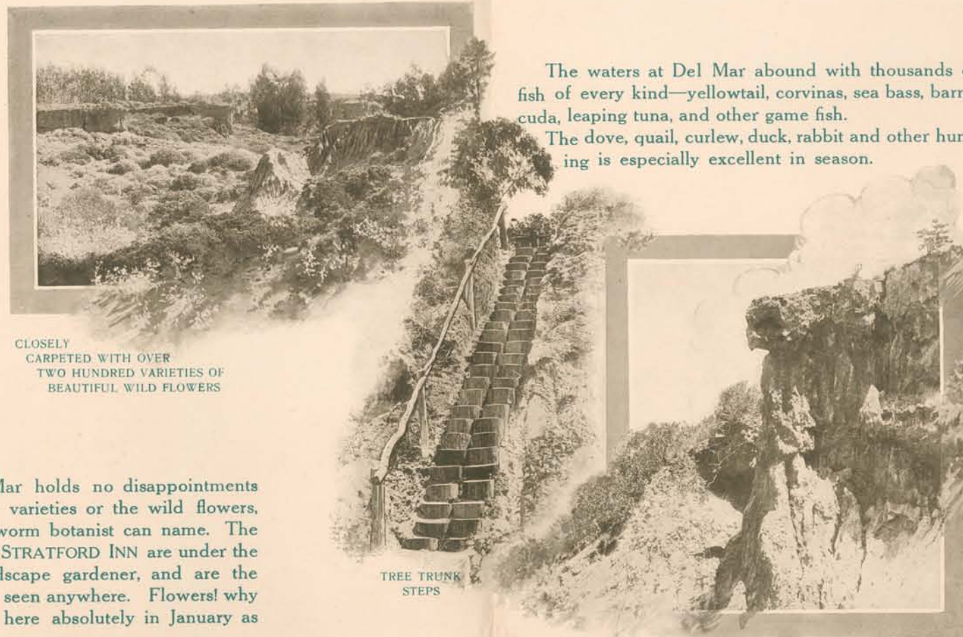
CLOSELY CARPETED WITH OVER TWO HUNDRED VARIETIES OF BEAUTIFUL WILD FLOWERS

The location and surroundings of Del Mar provide perpetual spring-time climate of remarkable salubrity and unfailing evenness, both in winter and in summer, making it a haven of rest for "tired nerves." Neither day nor night will one suffer from the heat, or shiver from the cold, tho' they sit without wraps and bare of head.