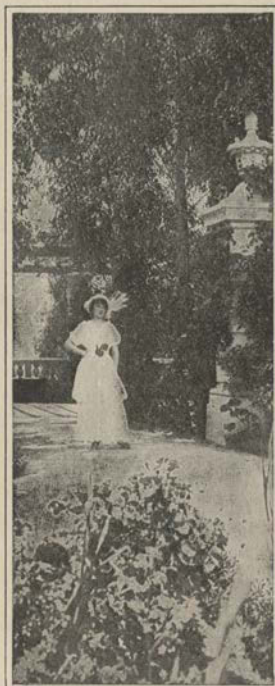
"COURT OF LEAP YEAR NOOK"

In the face of prophecies of failure, competition by the big San Francisco Exposition and the waging of the world's greatest war,