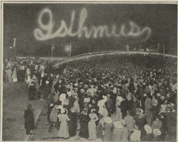
AT THE END OF THE ISTHMUS

"You have made a most beautiful Exposition, on a place made beautiful by nature, and made more beautiful by art,—one of the most beautiful I have ever seen. It is so beautiful that I wish to make an earnest plea that you will keep the Exposition going for another year. I hope, not only will you keep the Exposition running for another year, but that you will keep these buildings of rare phenomenal taste and beauty where they are."