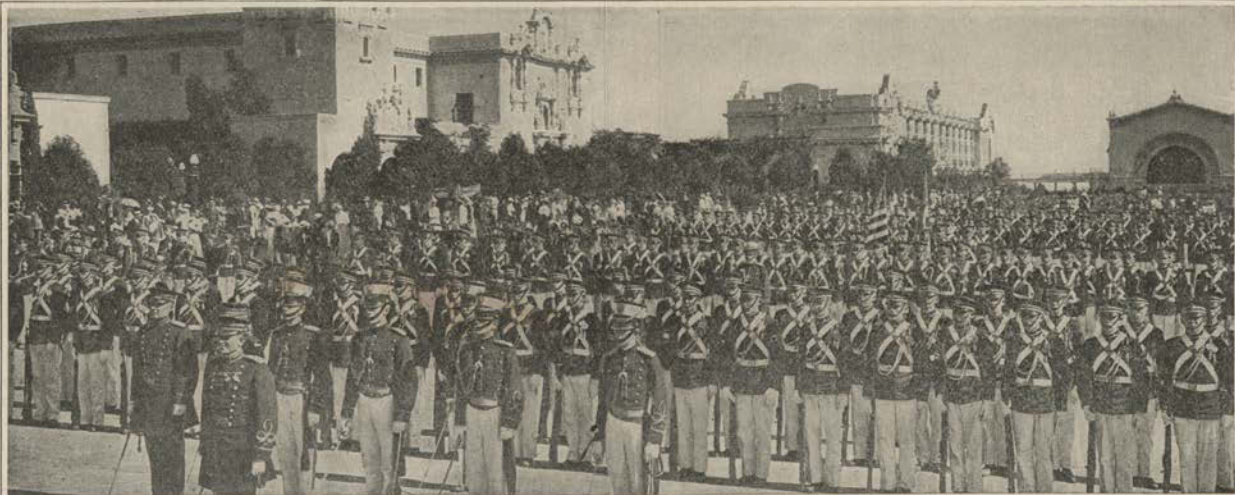
A CADET PARADE IN PLAZA DE PANAMA

the total admissions were more than two and one half million and a surplus remained December 31, 1915. New Year's Day the new exposition was declared open.