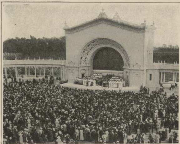
AT THE OUTDOOR ORGAN

"Your charming fairyland provides ample reward for the trip any traveler can make and proves that there is a real end to the rainbow."