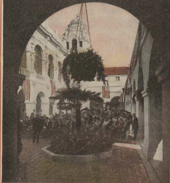
OUTDOOR LECTURE IN MIDWINTER

Railroads and steamship lines are offering attractive rates; San Diego hotels, apartment houses and business concerns are maintaining prices that rule when no Exposition is attracting guests. A trip to San Diego has attractions greater than any other American journey: why not GO TO SAN DIEGO?