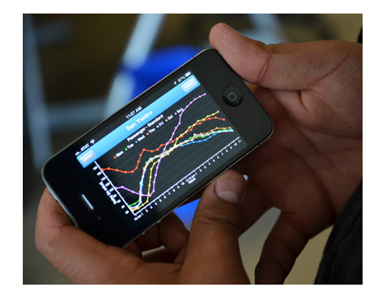
Historical information tracks wait times hourly every day t border crossings.

Some of the early online reviews for the "Best Time to Cross the Border" for iPhone have applauded the new app: "Amazing app! So helpful!" "As a Mexican, I find this app extremely helpful... and I'm pretty sure it'll be helpful for a lot of people." "The data is way more accurate than the other app I used to have."