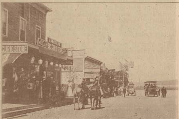
STREET SCENE IN TIJUANA, OLD MEXICO.

Be sure to purchase all Tickets at the office of THE SCENIC ROUTE, the headquarters and starting point of all Excursions, FIFTH AND BROADWAY