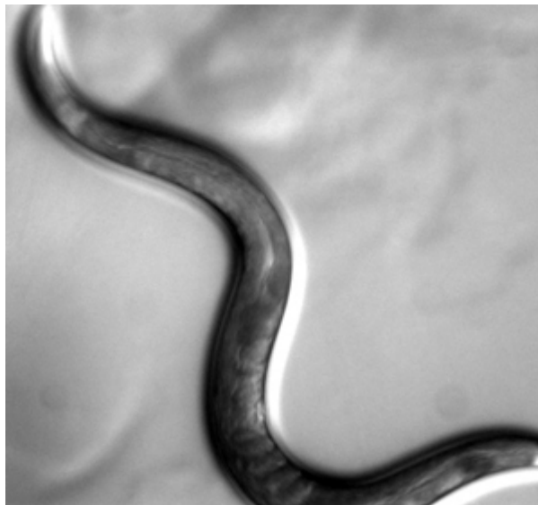
Black-and-white image of live C. elegans nematode

More than a decade of genome sequencing projects have generated a comprehensive “parts” list of the genes required to build an organism, an inventory of the necessary cellular building blocks. But the functions of many of these genes remain unknown, preventing researchers from fully deciphering their cellular pathways and how their interactions might shed light on human disease.