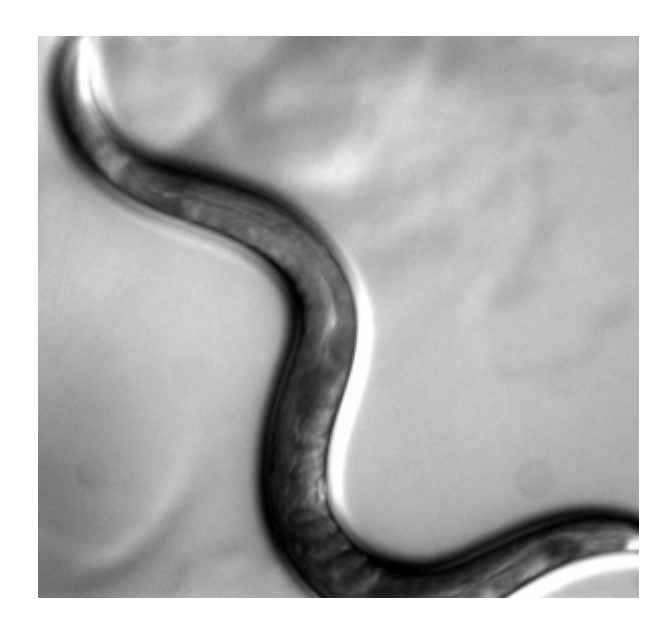
Black-and-white image of live C. elegans nematode

More than a decade of genome sequencing projects have generated a comprehensive "parts" list of the genes required to build an organism, an inventory of the necessary cellular building blocks. But the functions of many of these genes remain unknown, preventing researchers from fully deciphering their cellular pathways and how their interactions might shed light on human disease.