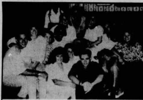
Last year's Orientation Leaders show the camaraderie they developed for helping this year's freshman class.

O.L.'s will complete 12 to 15 hours of training during spring quarter, and will plan the orientation program for summer orientations. During orientation, they will plan and organize activities, help students plan their schedules and register for classes, conduct tours of the campus, and lead small group discussions. O.L.'s will lead small groups of approximately fifteen students through four two-day sessions. In addition,