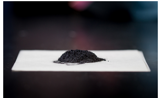
Used cathode particles from spent lithium ion batteries are recycled and regenerated to work as good as new. (more photos on Flickr)