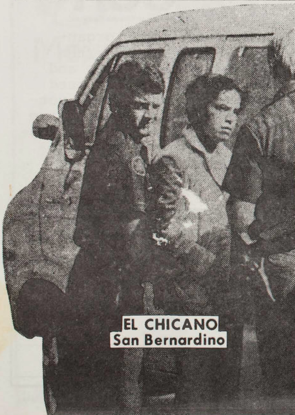
EL CHICANO San Bernardino