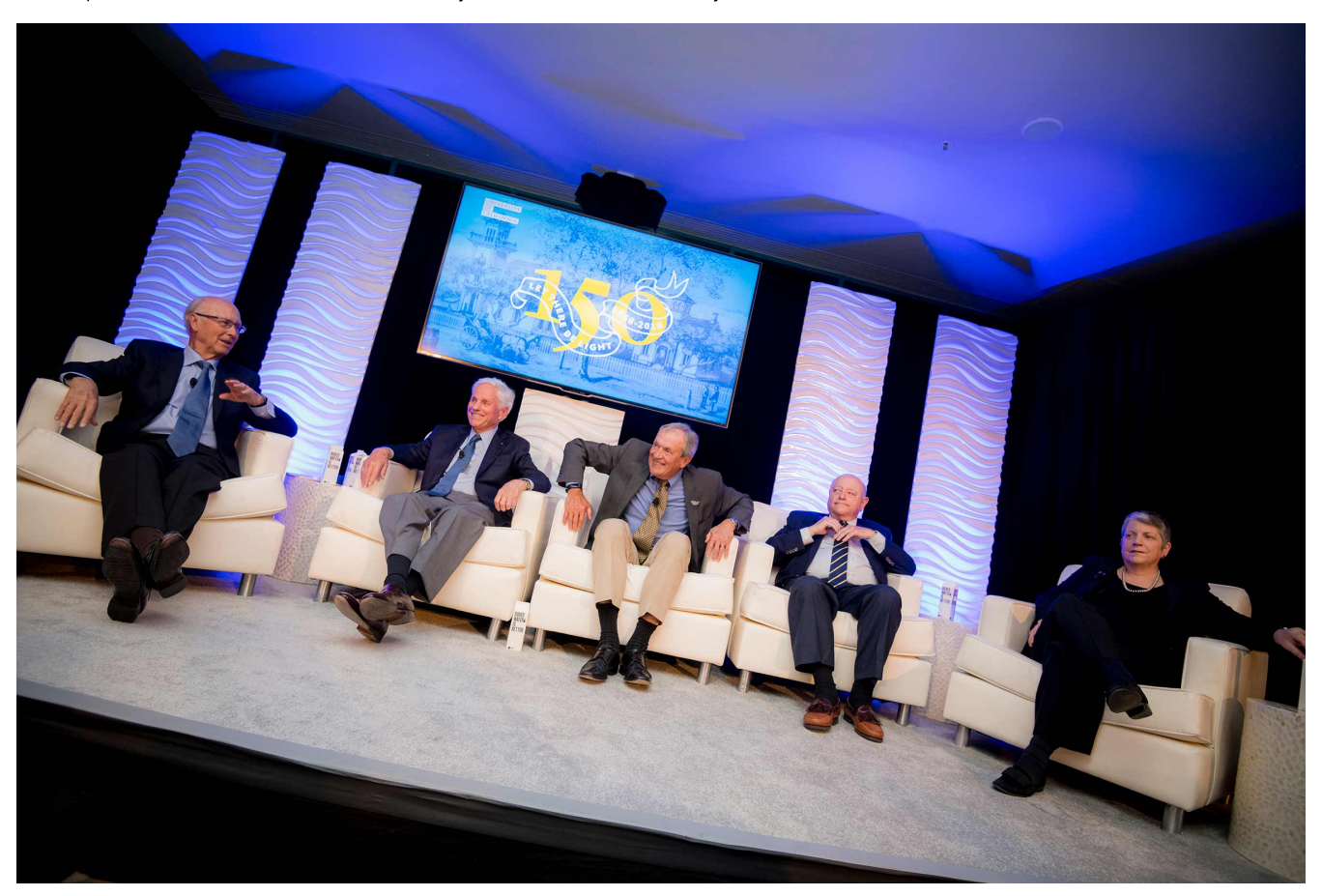
Five presidents recently gathered in conversation at UC San Diego to celebrate UC's contributions to California and beyond.

Five UC presidents share stories about the university's bold rise over the last 150 years