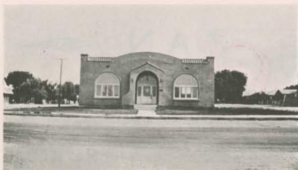
San Ysidro Public Library

S AN YSIDRO (pronounced E-see-dro), the most southwesterly town and post office in the United States, is a thriving community situated on the gentle slope of one of the most beautiful valleys in Southern California, fourteen miles south of the city of San Diego by paved boulevard, and five miles from the ocean, which is visible from the town. The permanent population is about 1200, which increases to 2000 in winter. All natural conditions combine to give to this particular locality what is perhaps the most delightful all-year climate in the world, the records of the United States Weather Bureau showing the mean annual temperature at noon to be about 70 degrees in summer and 60 degrees in winter. The outdoor life which the climate invites, amid sunshine, flowers and ocean breezes, combined with entire absence of any adverse natural conditions, insure general healthfulness. The school records show few absences on account of illness, and the continued activity and youthful spirit noticeable in residents of advanced years, are matters of comment by visitors.