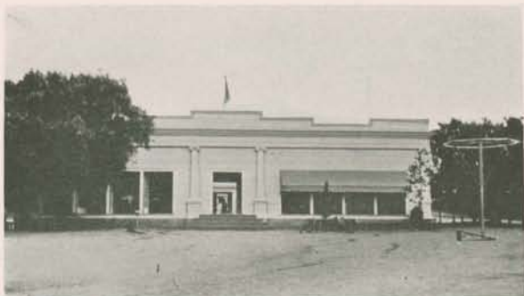
San Ysidro Public School

of Lower California, a region rich in natural resources the development of which is just beginning. Tijuana is widely known as a pleasure resort and is visited by thousands of tourists weekly. The city has been developed by American capital and its business activities are carried on mainly by Americans whose local trade adds to the business prosperity of San Ysidro.