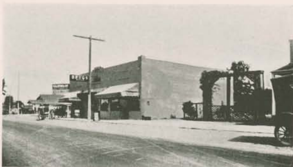
One of San Ysidro's Business Sections

The town has electric light and power, including street lights, a newspaper, modern stores, markets, garages, etc., as well as daily service by San Diego laundries, bakeries and ice company.