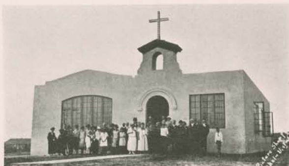
San Ysidro Church

State system of paved highways, and is on the main line of the San Diego and Arizona Railway. Transcontinental freight and passenger service is available at a station near the town. Transportation to and from San Diego is furnished by a well-managed stage line operating large, modern motor coaches. Splendid bathing beaches are reached by short drives over paved roads, and all the points of interest for which San Diego city and county are noted are within easy reach.