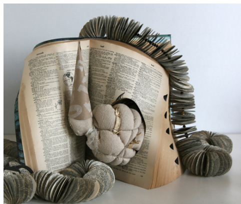
ger, Bonita, California. "enough, never," 2011

The San Diego Book Arts will hold their Fourth National Juried Exhibition of works of art in book form at UC San Diego's Geisel Library from May 26 through July 8, 2012. Nearly 60 books—running the gamut from fine press books and mixed media art objects to sculptural works of art and woodcut works—will be featured in the exhibition, which is co-sponsored by UC San Diego's Mandeville Special Collections Library. While some of the objects on display adhere to the traditional book format, others employ the book as a canvas for art, merely taking their creative cue from the book format.