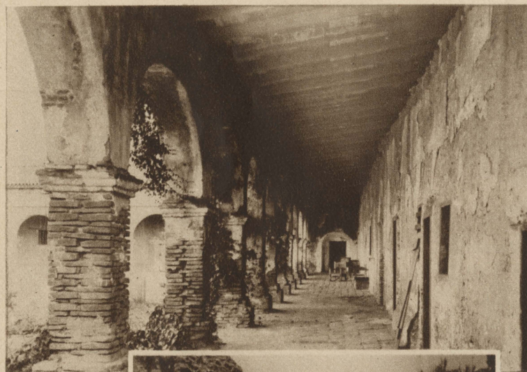
Massive corridors showing sound construction of old missions.