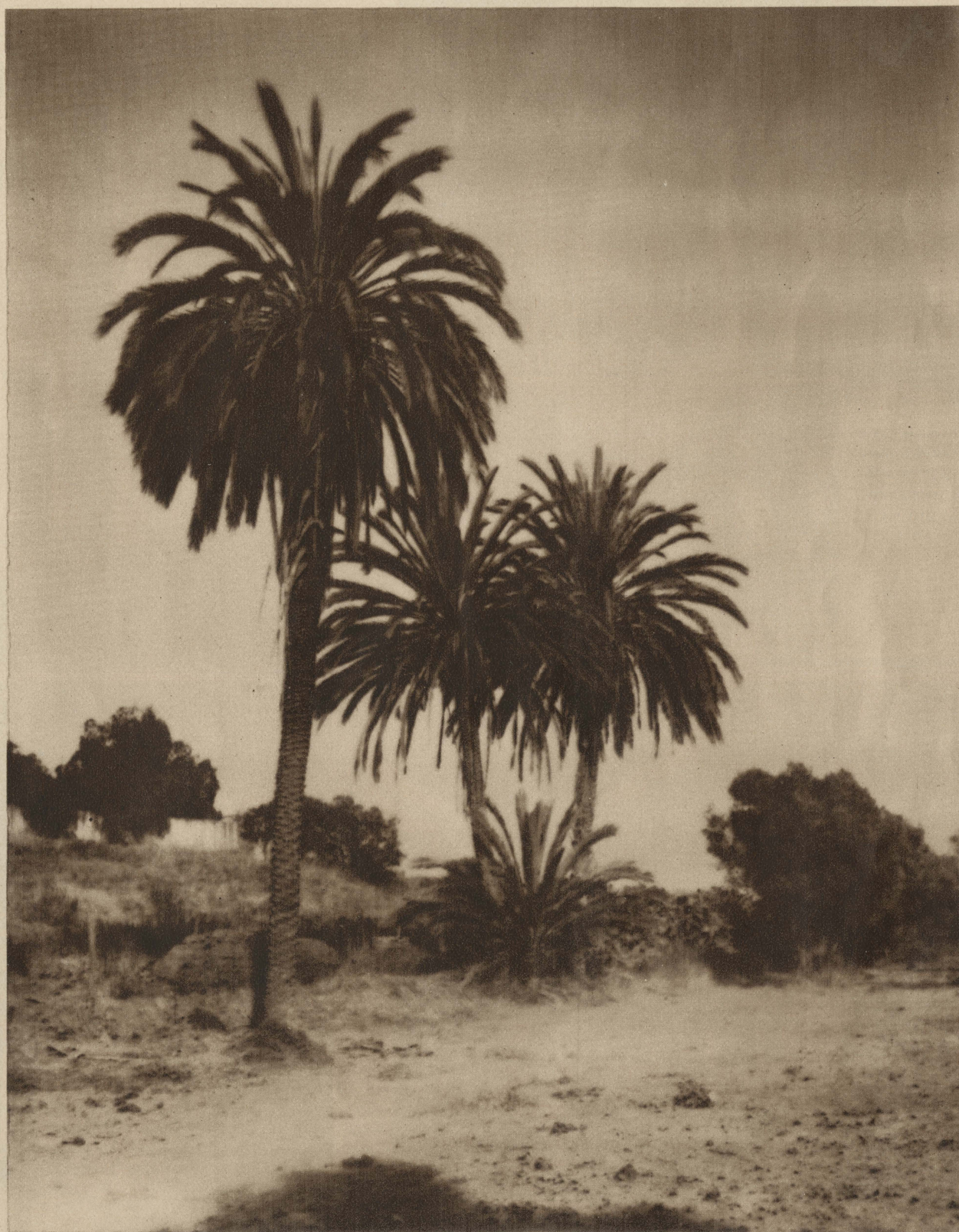
Original palms planted by Father Junipero Serra at San Diego De Alcala—the first of the California Missions