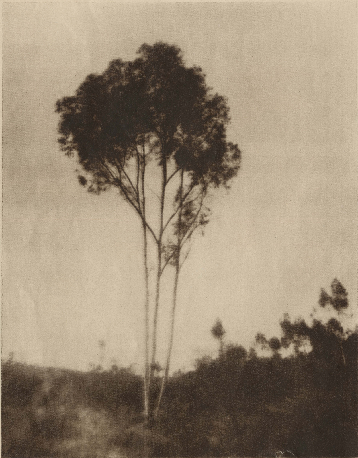
"Three Graces"—with slender, trim and spreading tops command admiration for the entire family of the Eucalyptii.