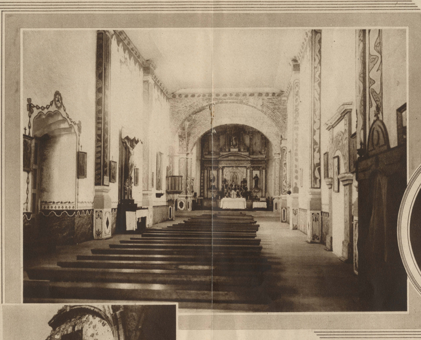
(Interior of the San Luis Rey Mission) One of the largest and most beautiful of the early California Missions—one-half hour motor trip from Hotel del Mar.