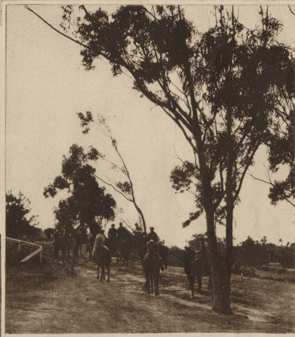
Daily exercise through the wooded hills of Del Mar.