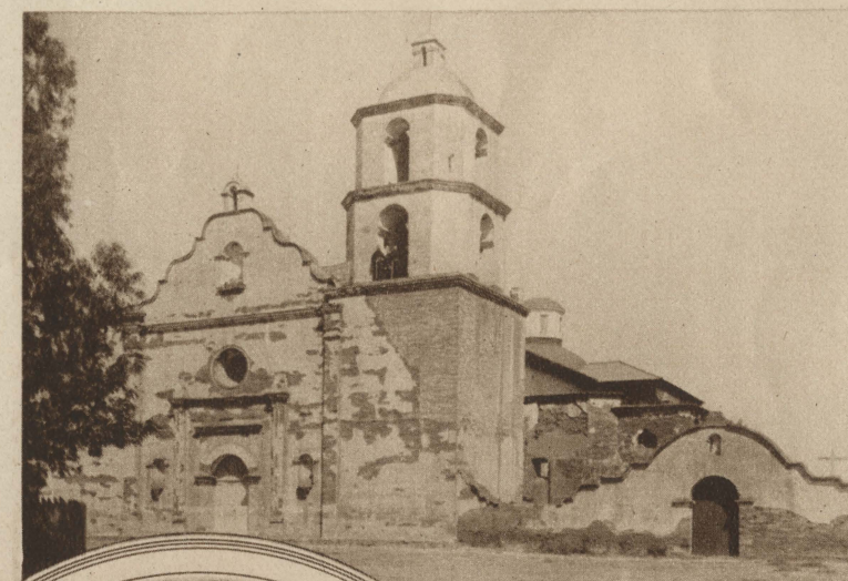
San Luis Rey, one of the largest and most beautiful of the missions. Note the Fathers in the tower.