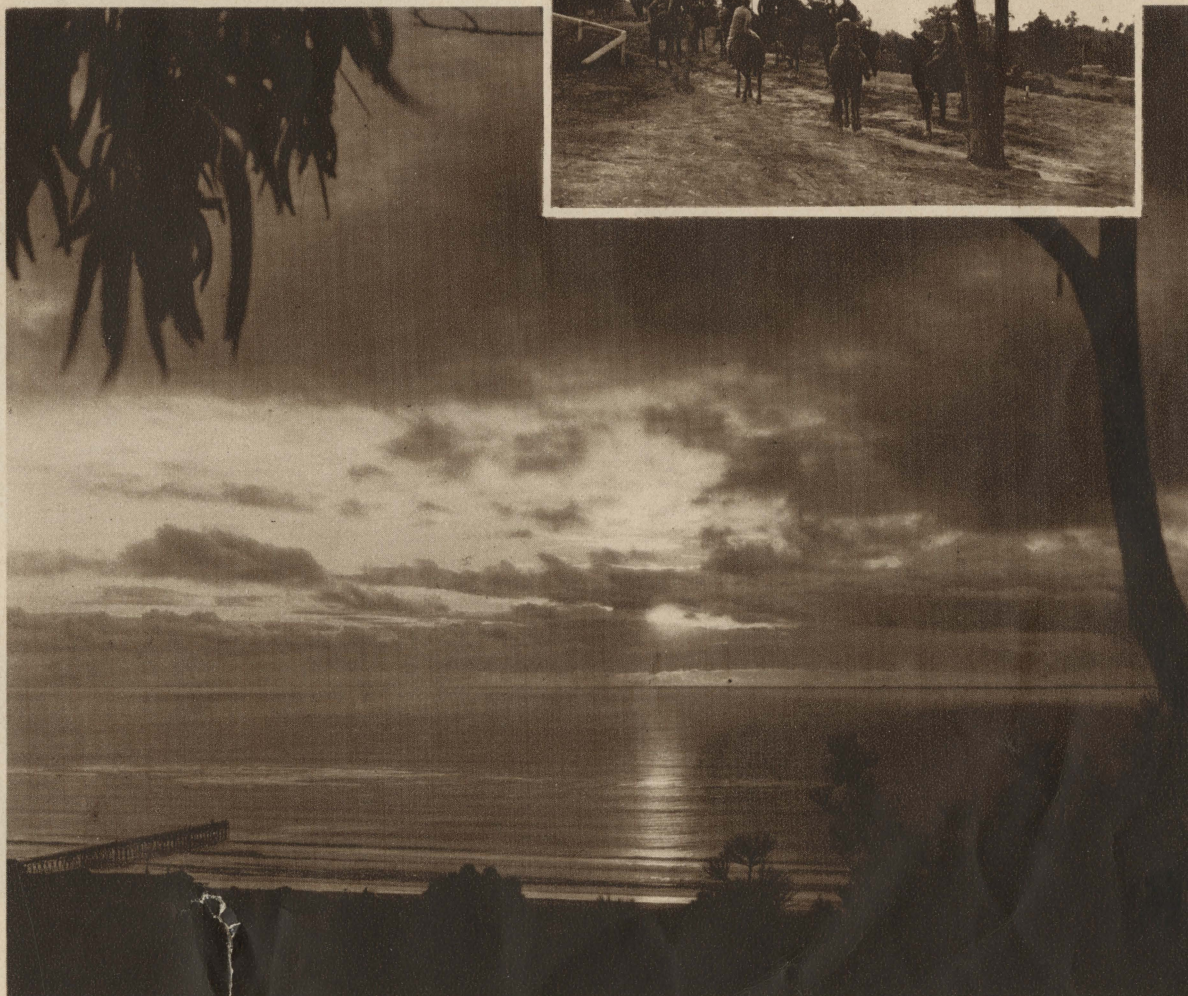
A fitting climax to a day full of activity at Del Mar. "Sunset on the Pacific" from the veranda of the hotel. The Del Mar Pier at the left.