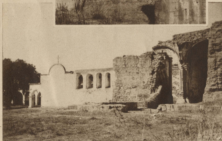
Angelus Tower where musical chimes called the devout worshippers to their morning, noon and evening prayers.