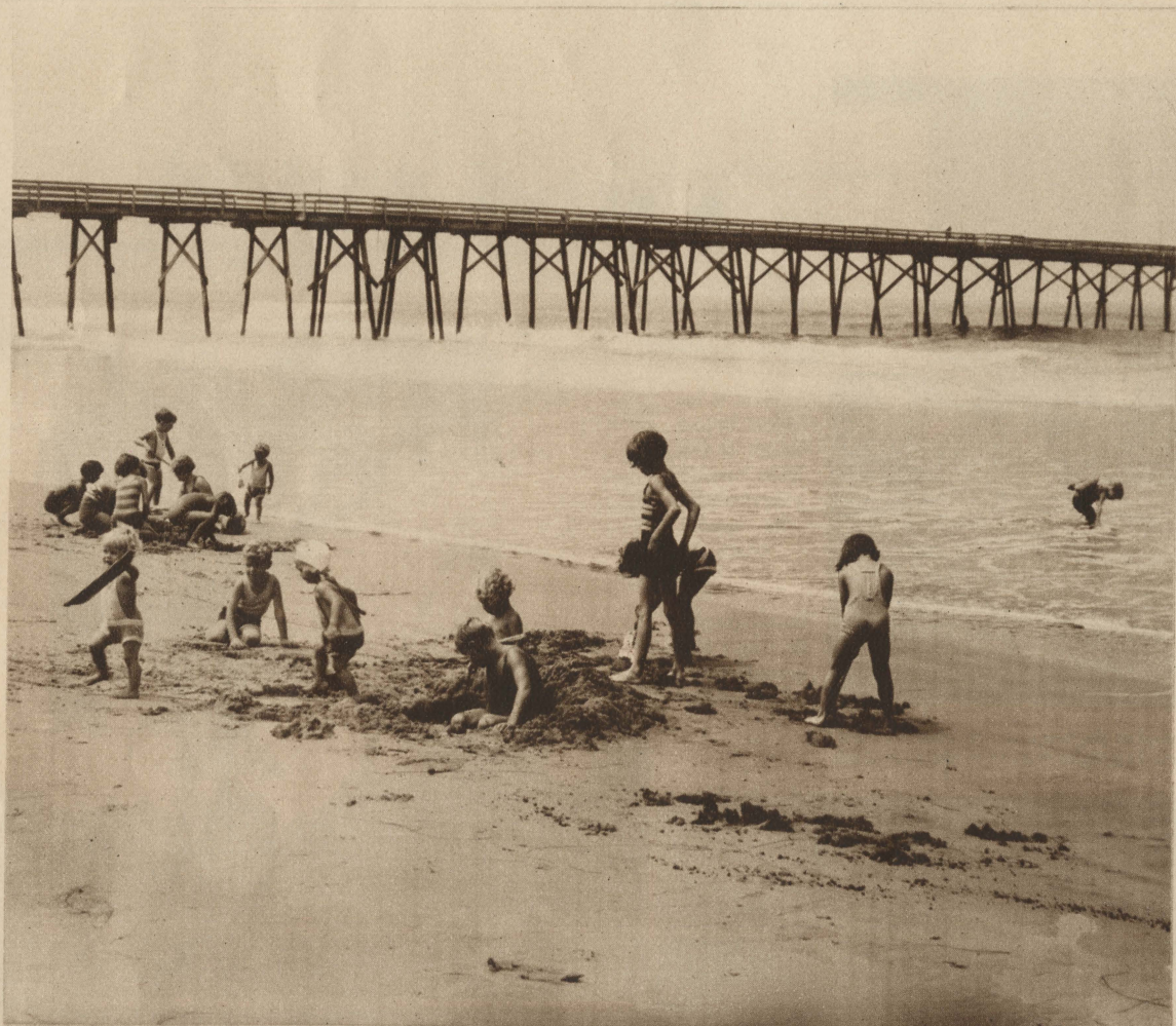
Little children—yes, even babies—expel their energies digging—running and making mud pies and sand houses on the broad, safe beach at Del Mar