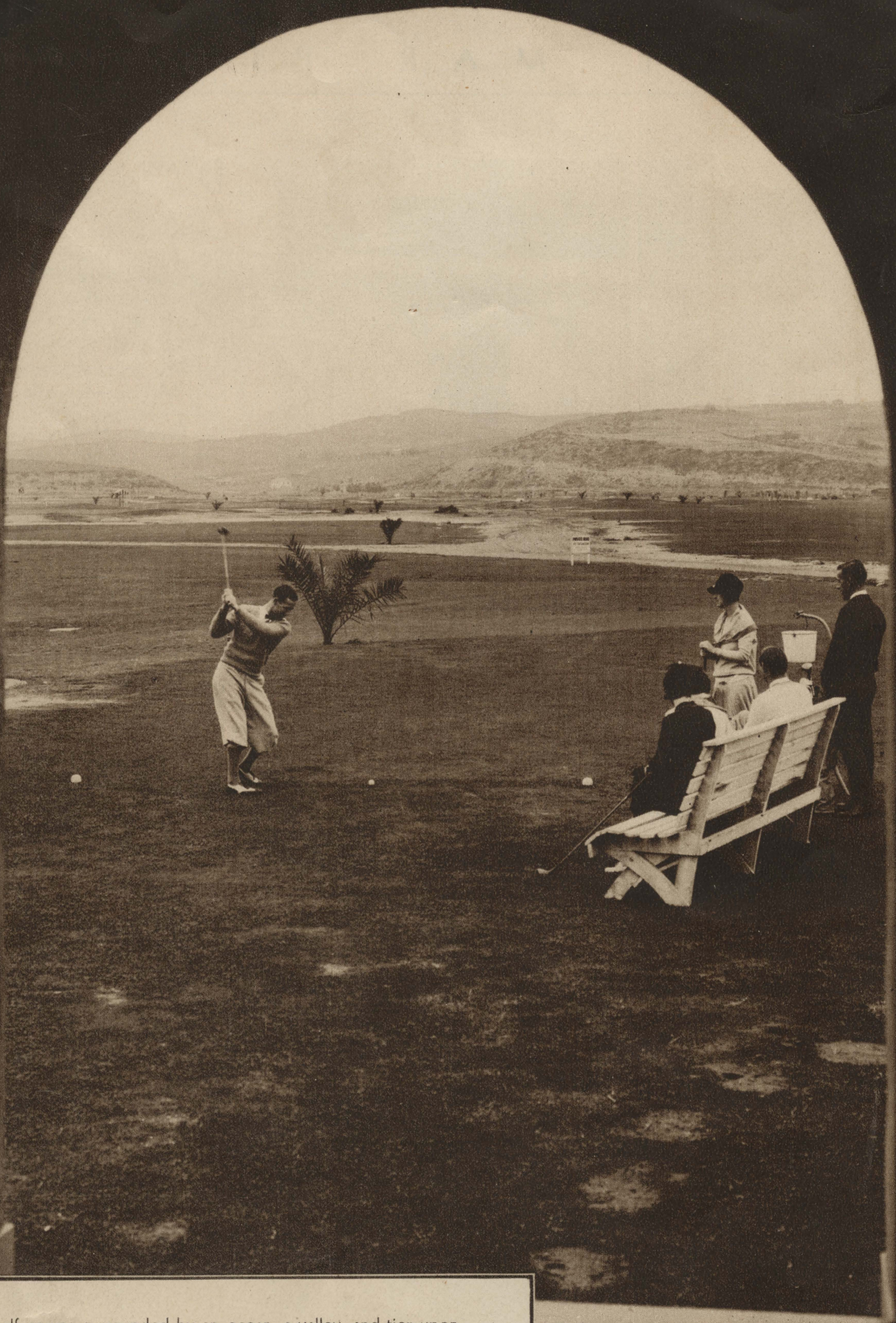
A golf course surrounded by an ocean, a valley, and tier upon tier of picturesque mountains—that is the Del Mar Golf Course