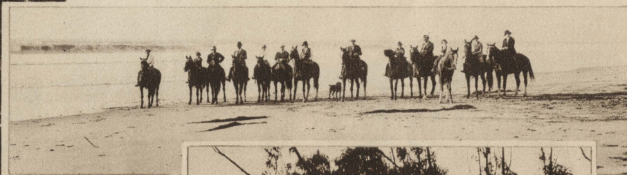
Several miles of firm, broad beach at Del Mar furnish enjoyment for the equestrians.