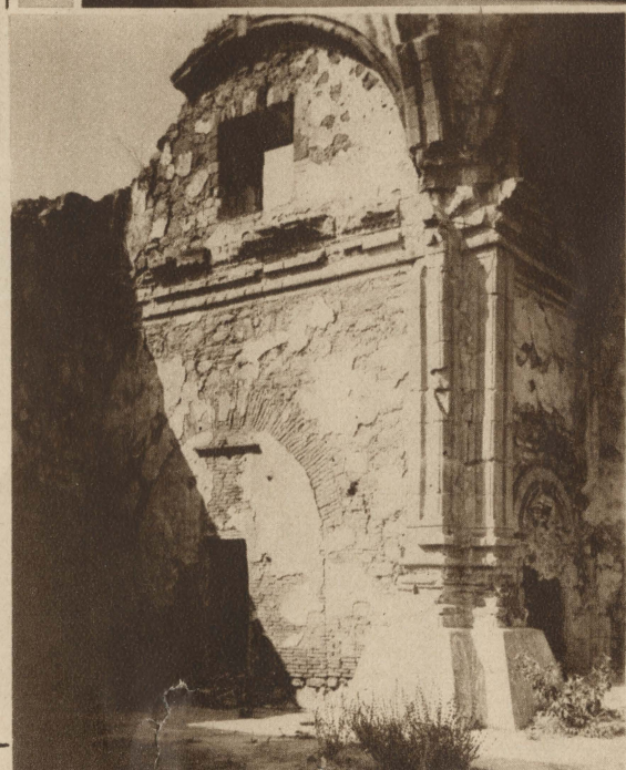
Not a light and shadow effect of Rheims Cathedral but one of our early California Missions.