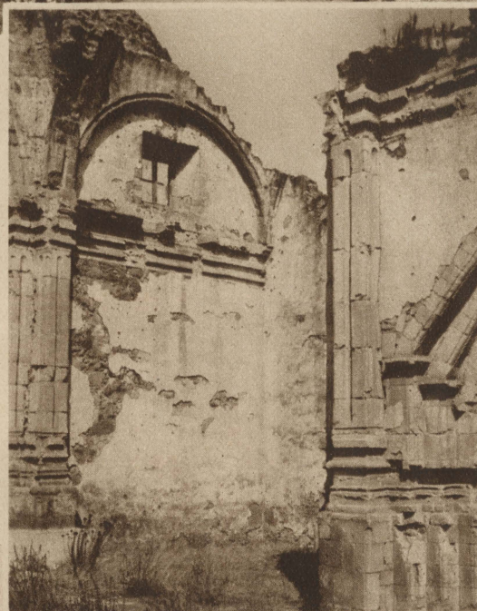
Architectural asymmetry is evident in the ruins of these old missions.