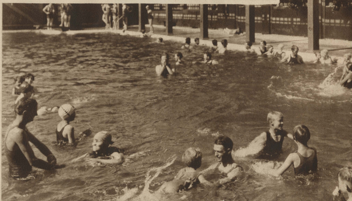
The open-air salt water plunge at Del Mar.