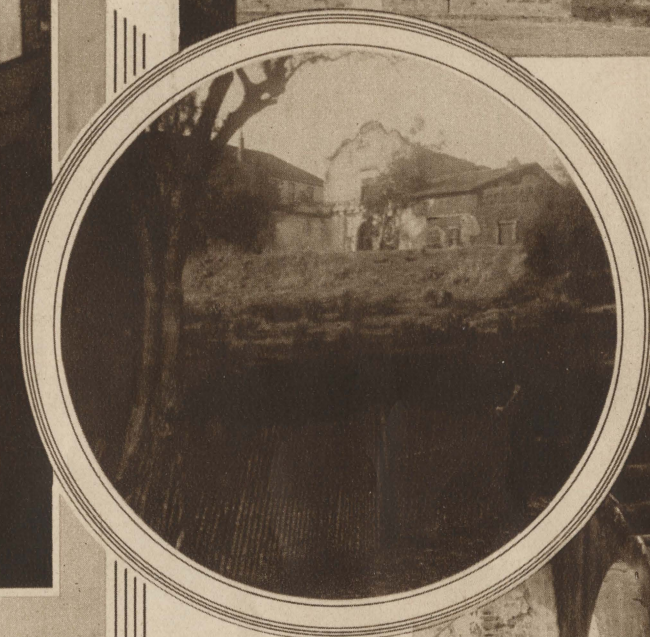
First of the California missions—San Diego de Alcalá.