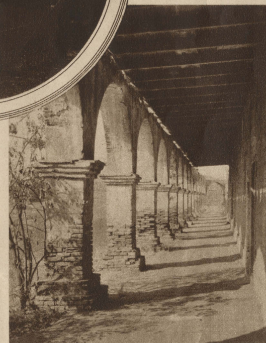
Still beautiful after more than a century of exposure to sun, wind and rain.

If these old Missions were 20th Century achievements they would still be marvelous. Designed, constructed and decorated as they were in 1769 and 1798, by the Franciscan Fathers, with Indian labor, crude implements and materials brought on shoulder from the far recesses of the mountains, they stand today as one of the miracles of early California history. Not only were the Missions temples of divine worship, but, located as they were, a day's journey by foot apart, they were the way-farers refuge. Welcome awaited the stranger. To friendly visitors, hospitality reigned supreme, and against the enemy, they were even used as fortresses. These old Missions stand today, as sacred inspiration to all loyal Californians. They were the out-posts of Western Civilization and are the very cornerstones of the development and progress of the Pacific Coast of the United States. ♦ The Missions portrayed here are all in the Del Mar section and within short driving distance of Hotel Del Mar.