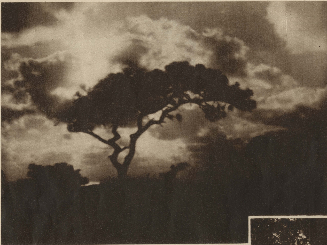
The Torrey Pines. With one exception these pines are found only in the Del Mar section. They are the most famous of all the pines—lower, broader, with longer and sharper needles.

THE scenic grandeur—the matchless climate—the picturesqueness and romance of the surrounding country—the comfort and service afforded at Hotel Del Mar, in San Diego County, along the Riviera of the Pacific, in Southern California, is stamping this Old English hostelry as one of the most refreshing and delightful places to be visited in this land of eternal sunshine.