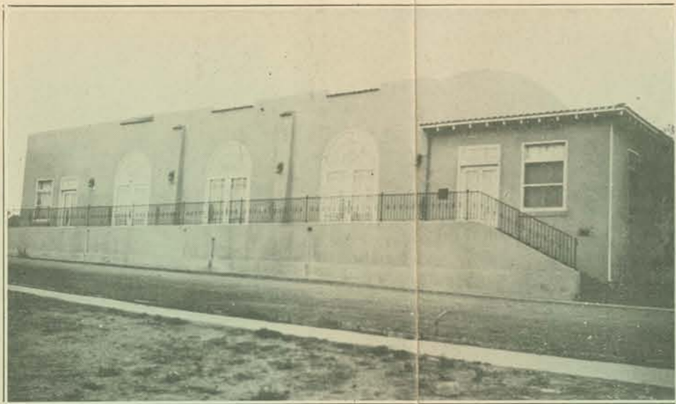
SAN YSIDRO CIVIC CENTER