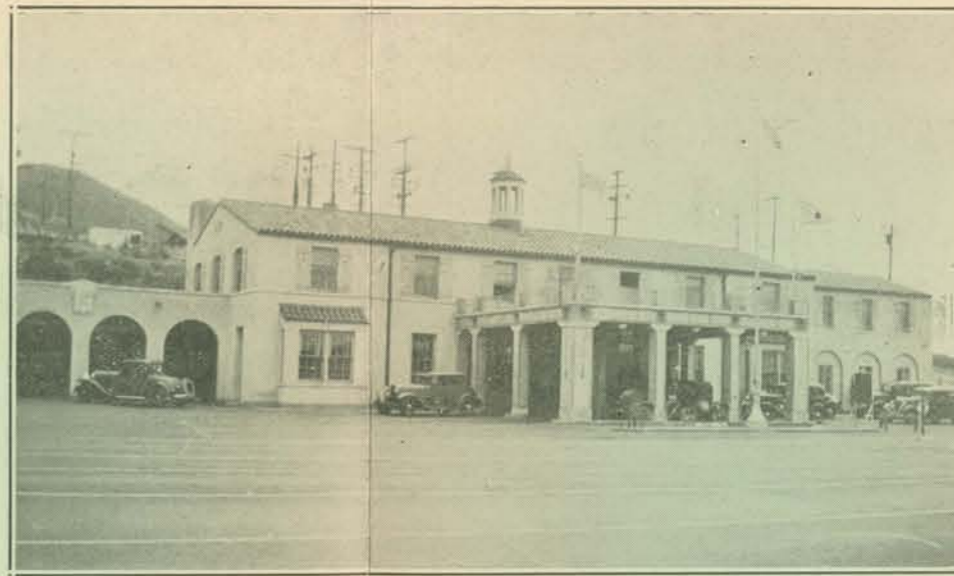
U. S. IMMIGRATION AND CUSTOMS

A real home in San Ysidro needs only the desire to build—the materials are at hand.