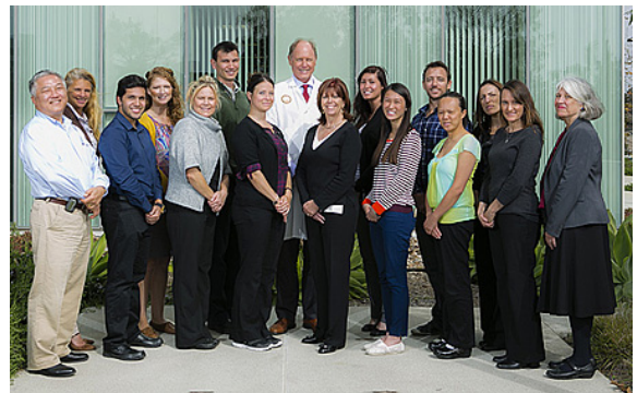
UC San Diego is recognized for diagnosing Parkinsonian disorders accurately, and early on, while providing personalized state-of-the-art care to each patient.

The Movement Disorder Center identifies and treats other disorders related to Parkinson's disease, such as progressive supranuclear palsy, corticobasal degeneration, multiple system atrophy and dementia with Lewy bodies. It also manages tremors, dystonias, myoclonus and choreas. The center's multidisciplinary team is made up of neurologists, neuropsychologists, speech, physical and occupational therapists, a neurosurgeon, nurse practitioner, and a social worker, all specialized in movement disorders.