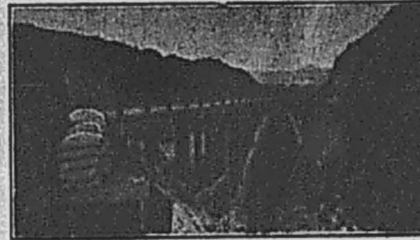
TWO OF THE MANY BRIDGES BUILT BY HOLLAND CONSTRUCTION CO.

SLOAN to Fletcher, [5 letters] 1/7/19, 1/24/19, 2/11/19, 2/18/19, 3/5/19