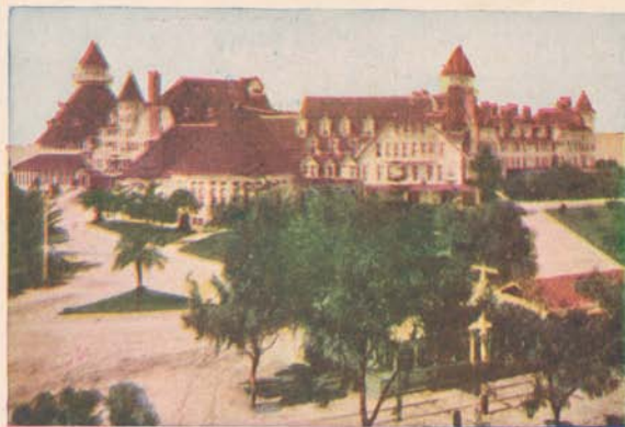
Hotel del Coronado