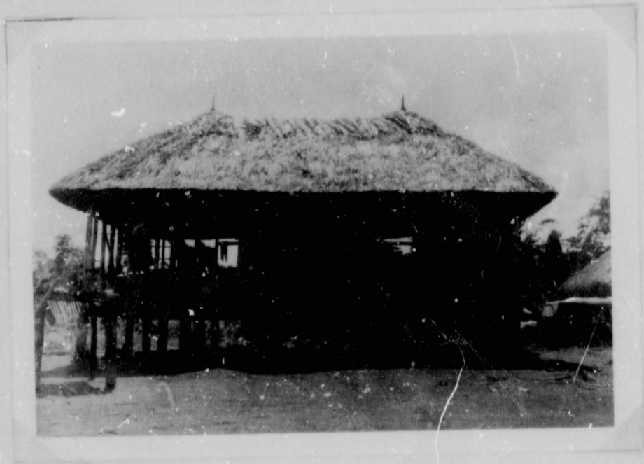
House on block I40.