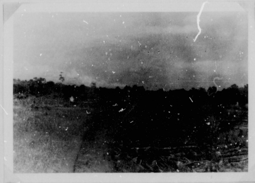
Looking down to blocks I38 & I37; in the background, blocks I43 & I32 (foreground)

Two scenes showing progress being made on the 15 acre blocks at Warangol