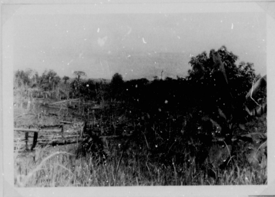
Block No. I44 and owner, Tomatematem.