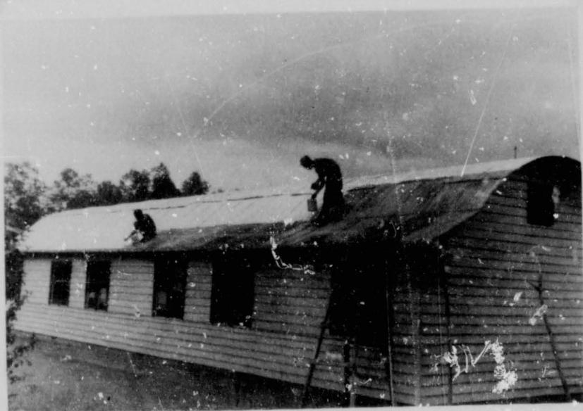
Painting the old classroom.