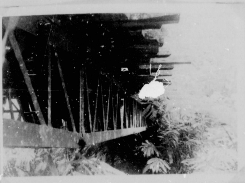
Showing the underneath construction needed in the Rabagi Bridge, which was open opened two years ago. This bridge opened up about 5000 acres of land.

Council Roadwork has helped increase the economic development of this area.