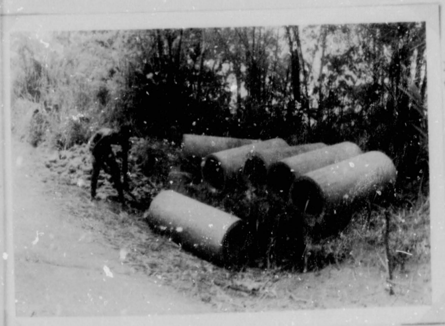
Present work involves increasing drainage efficiency.