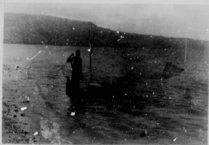
and a fish.