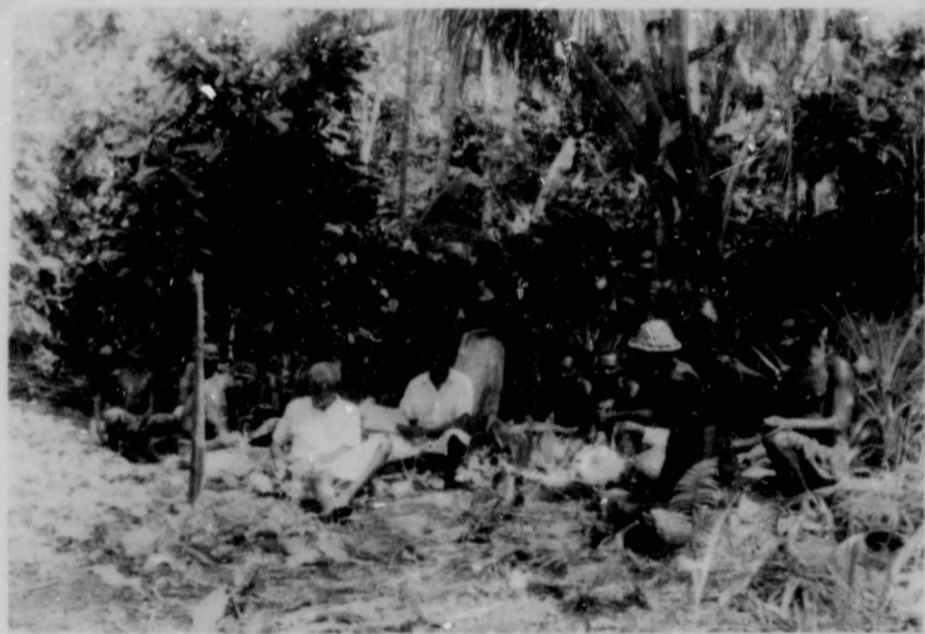
Interested parties at a land court held at Reim.