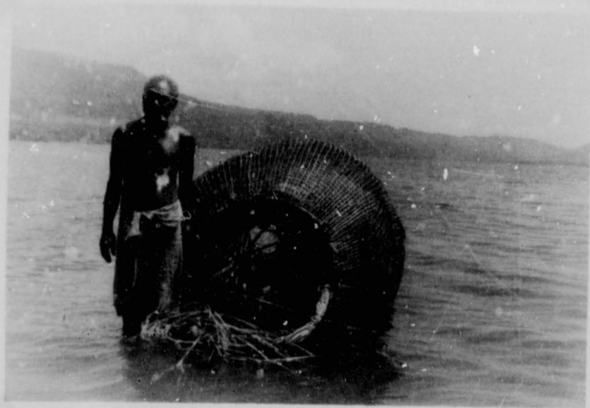
Bringing in a net,

On the coast the land is short and the people of Rabarus, Davaun and Nguvalian depend to some extent on fishing for sustenance. They are also ship's labourers in Rabaul.