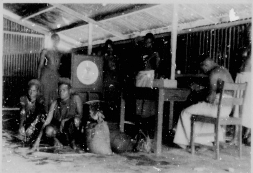
Wet Bean Payments.