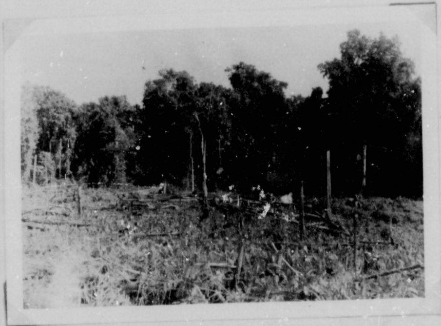
Background shows average type of timber being cleared.