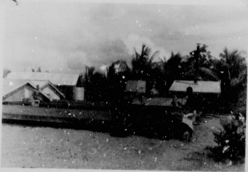
Drying Day at Rabuana Fermentery.