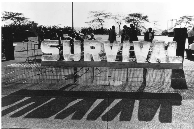
Survival Ice Sculpture, Messages from the World, UN Plaza, New York, 1982.