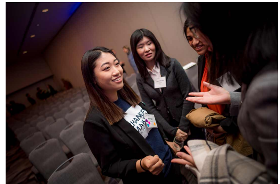
taken prior to the pandemic.

The institute is a natural outcome of UC San Diego's Ashoka U Changemaker Campus designation , which was awarded in 2017 based on the university's commitment to social innovation, changemaking education and its ability to translate that into real-world positive impacts. UC San Diego is the only UC campus to earn the designation and is one of only 45 Changemaker Campuses in the world.