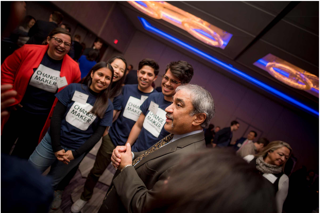
taken prior to the pandemic.

The new campuswide initiative will champion, oversee and reinforce changemaking efforts throughout UC San Diego