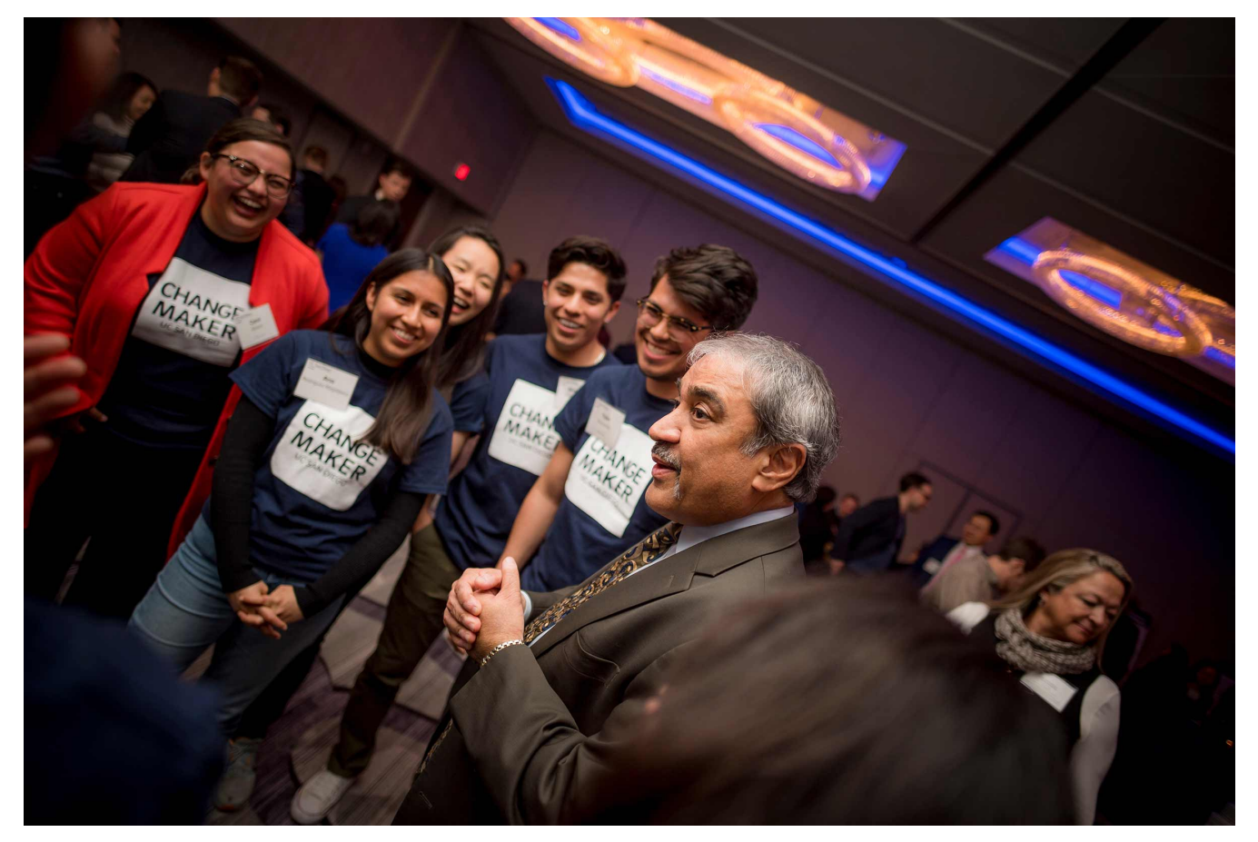
taken prior to the pandemic.

The new campuswide initiative will champion, oversee and reinforce changemaking efforts throughout UC San Diego