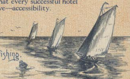
Sailing and Fishing.

THE very words "Southern California" bring to mind a smiling summer land rich with tropical vegetation and heavy with the perfume of flowers. It is the home of people who appreciate the beauties and comforts of life. And the social center of this fair land of blue skies and balmy breezes is the U. S. Grant Hotel, the pride of San Diego. One has only to be a guest at this palatial hostelry, or even a visitor enjoying the hospitality of the Bivouac Grill, to understand the reasons for the decided preference shown for the U. S. Grant. Built at a cost of $2,000,000, it is the best appointed and the most modern hotel on the Pacific Coast. Every convenience and comfort a patron could possibly demand is at his instant service. The location itself leaves nothing to be desired. It has what every successful hotel must have—accessibility.