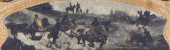
ARTILLERY GOING INTO ACTION