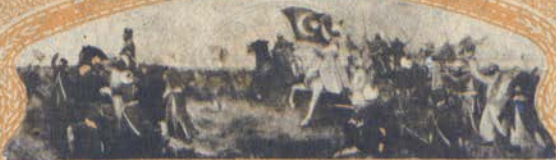
SULEMAN ADVANCING ON BAGDAD