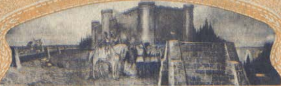
JOAN OF ARC AT ORLEANS