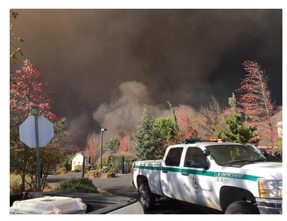
U.S. Forest Service law enforcement vehicles in a neighborhood damaged by 2018 Camp Fire.