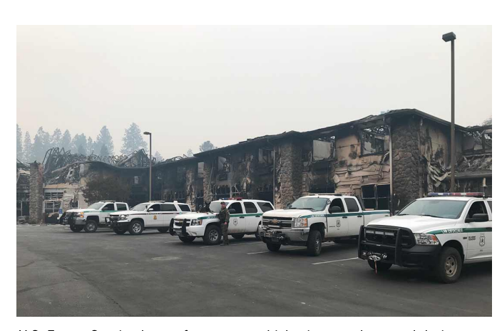
U.S. Forest Service law enforcement vehicles in area damaged during Camp Fire.

"A lot of the software systems used for fire simulation today require a lot of manual input," said Block in a UCTV interview. "The way that WIFIRE works is automating a lot of that, so that you don't have to coordinate and specify a bunch of data sets that are already there for you. That makes the system faster and it can work for you."