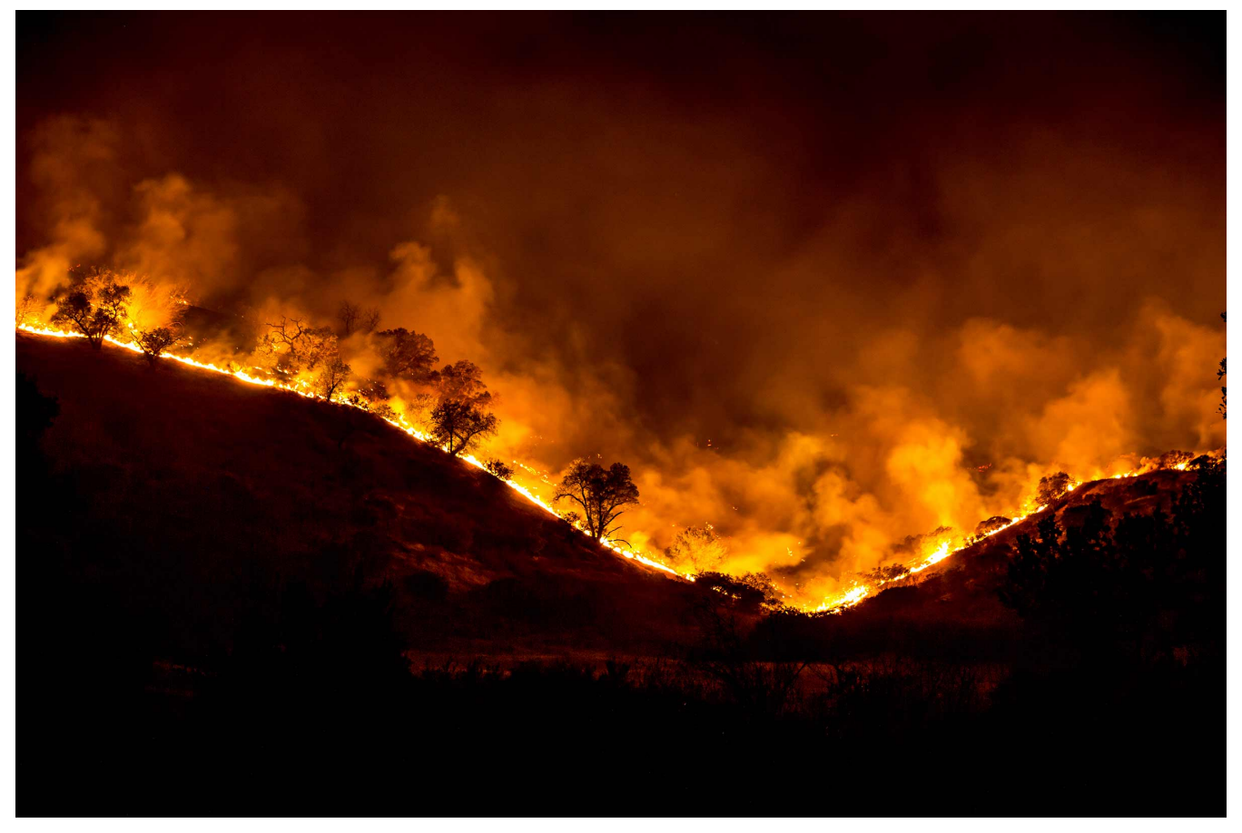
The 2018 Woolsey Fire scorched nearly 100,000 acres in Los Angeles and Ventura counties.

UC San Diego matches increased fire danger with improved monitoring capability