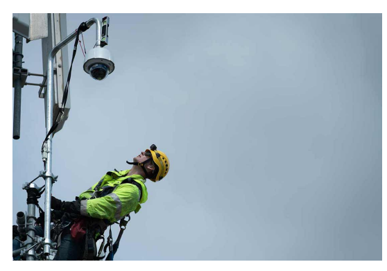
A technician installs an ALERTWildfire camera.

Predictive analytics techniques—now used with realtime data analysis—were recently used by firefighting authorities in a majority of the fires in Southern California over the last two months, including the Palisades and Getty fires. This data-driven approach to response is thanks to a 150-day statewide pilot program called FIRIS (Fire Integrated Real-Time Intelligence System), launched in September under state funding secured by Assemblywoman Cottie Petrie-Norris (D-Laguna Beach).