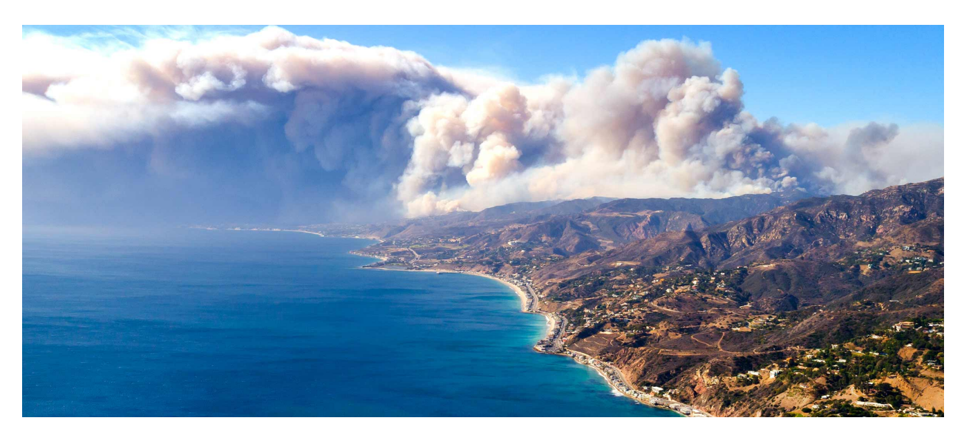
The Woolsey Fire seen from the Los Angeles coastline.

WIFIRE Lab works with firefighters throughout California, along with more than 130 organizations and individuals that reached out for informal help and collaboration. The Orange County Fire Authority, the Los Angeles County Fire Department, the Ventura County Fire Department, and the California Public Utilities Commission are among those collaborating with WIFIRE.