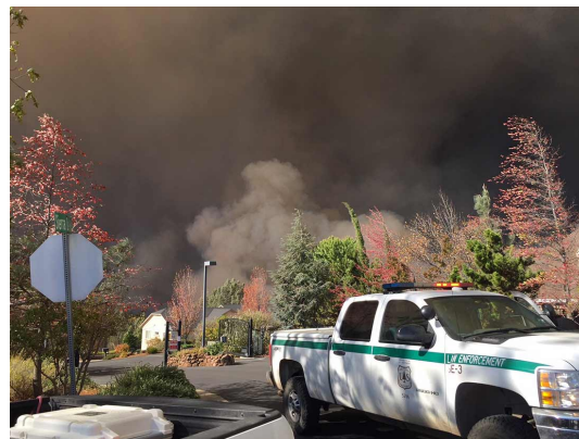
U.S. Forest Service law enforcement vehicles in a neighborhood damaged by 2018 Camp Fire.