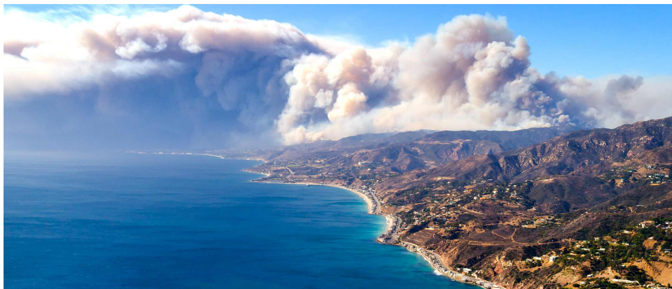
The Woolsey Fire seen from the Los Angeles coastline.

WIFIRE Lab works with firefighters throughout California, along with more than 130 organizations and individuals that reached out for informal help and collaboration. The Orange County Fire Authority, the Los Angeles County Fire Department, the Ventura County Fire Department, and the California Public Utilities Commission are among those collaborating with WIFIRE.