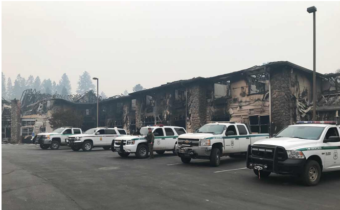
U.S. Forest Service law enforcement vehicles in area damaged during Camp Fire.

“A lot of the software systems used for fire simulation today require a lot of manual input,” said Block in a UCTV interview. “The way that WIFIRE works is automating a lot of that, so that you don’t have to coordinate and specify a bunch of data sets that are already there for you. That makes the system faster and it can work for you.”