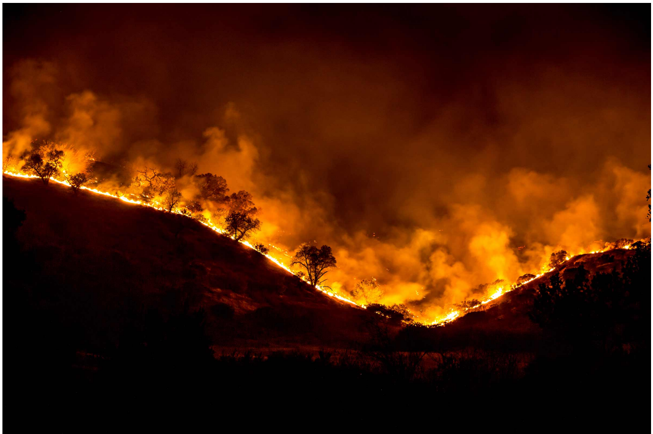
The 2018 Woolsey Fire scorched nearly 100,000 acres in Los Angeles and Ventura counties.

UC San Diego matches increased fire danger with improved monitoring capability