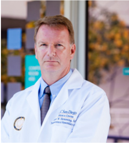
mming, transplant surgeon.

resection of the pancreas and bile duct, and portal decompressive procedures.