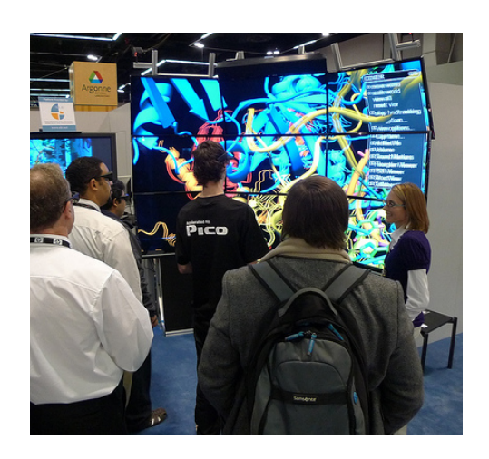
Supercomputing trade show view 3D visualization of m the Protein Data Bank on a Calit2 NexCAVE virtual-lay system.

The 3D Virtual Cell could do for cell biology what the Large Hadron Collider has done for particle physics. But instead of building a multi-billion-dollar facility, backers of the 3D Virtual Cell project believe they can build a virtual, rather than physical, resource that could be used by biologists and medical researchers for generations to come.