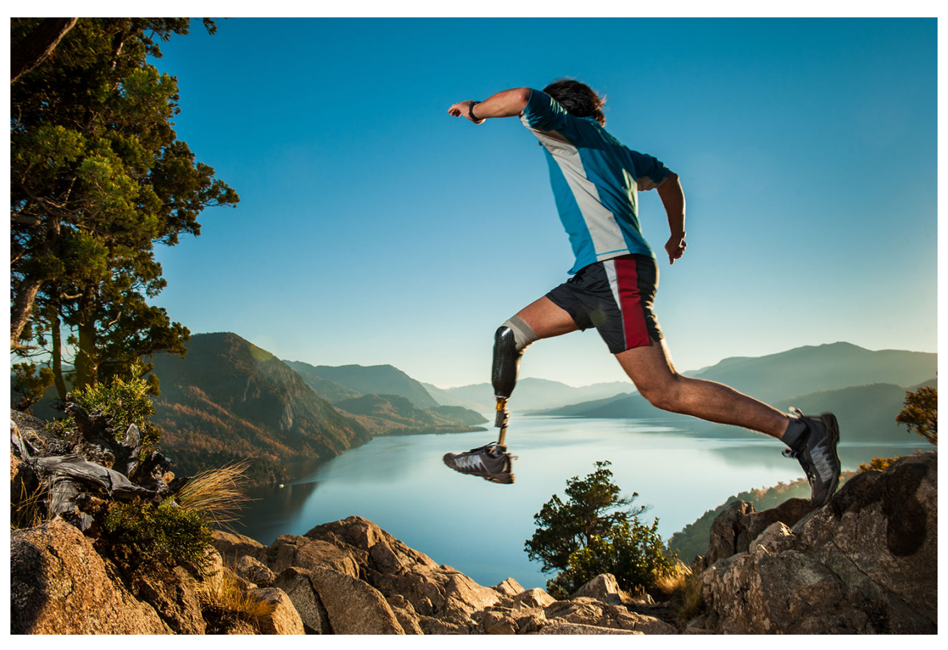
Engineers have created a new method to detect infections in prostheses for amputees and joint replacements.

Engineers at the University of California San Diego have developed a new non-invasive method to detect infections in prostheses used for amputees, as well as for knee, hip and other joint replacements. The method, which is at the proof of concept stage, consists of a simple imaging technique and an innovative material to coat the prostheses.