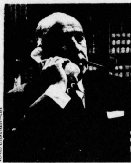
ATTORNEY GENERAL MITCHELL

Today the mobilization of the secret police and legal apparatus against enemies portrayed as "terrorists" has found sinister expression in the 1983 FBI Guidelines on Domestic Security/Terrorism and Reagan's National Security Decision Directive 138. Under these surveillance disruption programs, suspect ideas become the basis for increased investigation by the secret police in the name of "anti-terrorism," and then the hit squads move in for "preventive action." Meese had a special understanding of how effective COINTELPRO was in setting up and gunning down the radical Black Panther Party. For Meese and his ilk what was wrong with COINTELPRO was that it was exposed as illegal. This is where they want to make the political fight: to reestablish COINTELPRO on an open basis. Thus the successful Spartacist League lawsuit challenging these new FBI Guidelines was also a campaign against this shoot-first-ask-questions-