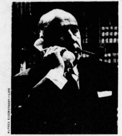
ATTORNEY GENERAL MITCHELL later McCarthvism and its foremost representative, Edwin Meese.

Today the mobilization of the secret police and legal apparatus against enemies portrayed as "terrorists" has found sinister expression in the 1983 FBI Guidelines on Domestic Security/Terrorism and Reagan's National Security Decision Directive 138. Under these surveillance/disruption programs, suspect ideas become the basis for increased investigation by the secret police in the name of "anti-terrorism." and then the hit squads move in for "preventive action." Meese had a special understanding of how effective COINTELPRO was in setting up and gunning down the radical Black Panther Party. For Meese and his ilk what was wrong with COINTELPRO was that it was exposed as illegal. This is where they be shot down, murdered in cold blood. League lawsuit challenging these new revolution in America ensures such FBI Guidelines was also a campaign against this shoot-first-ask-questions- richly deserve.