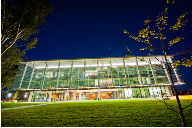
Medical Education and Telemedicine.

campuses must meet at least LEED silver certification (there are five levels possible—certification, bronze, silver, gold and platinum) and outperform the current state energy code by 20 percent. By 2020, the UC campuses have a goal to reduce greenhouse gas emissions to 1990 levels and by year 2025, UC strives to be a consumer of 100 percent carbon neutral energy.