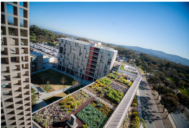
Keeling Apartments.