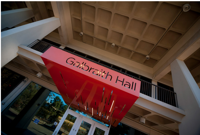
Galbraith Hall.

Blending architecture, campus history and sustainability, new Green Building Tours will be offered starting this winter, hosted by the UC San Diego Visitor's Tour Program in collaboration with UC San Diego Facilities Design and Construction and Housing and Dining Services . The two-hour Sunday bus tour will educate participants from the campus and community about how the campus's LEED-certified buildings—Leadership in Energy and Environmental Design, a third-party certification program developed by the U.S. Green Building Council—creatively employ sustainable design techniques and energy-efficient strategies. The tours, which are free and open to the public, will be held quarterly.