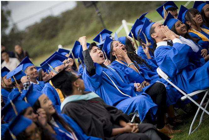
The Preuss School UC San Diego prepares first-generation and low-income students to succeed in college and beyond.

The top ranking comes as the school advances remote learning strategies