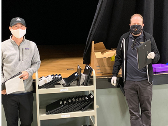
Qualcomm Inc. donated 300 laptops to The Preuss School to enable remote learning during the pandemic.

More information on U.S. News & World Report's "Best High Schools can be found here." And visit The Preuss School website to discover more about the school.