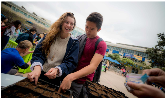
Students plant Torrey Pine seeds at the Earth Day Fair in Price Center Plaza.

Until they were awarded the grant from the Staff Sustainability Network, the trio’s efforts had been largely self-funded, with many of the nursery supplies and plants being donated. The three groundskeepers also became adept at re-using and re-purposing items for their nurseries.