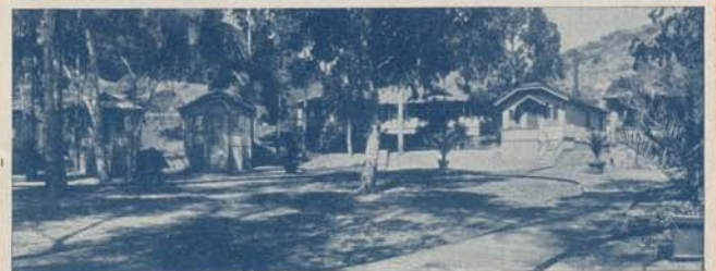
Hotel St. Catherine and Bungalows