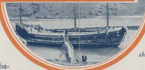
Old pirate ship, "Ning Po" at Isthmus

ful abalone shells on the ocean floor. The glass bottomed boat fleet comprises the Emperor, Empress, Princess and Cleopatra. The fast power boat, "Blanche W," makes evening trips with searchlights on her deck to see the thousands of