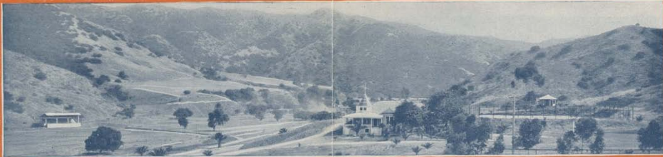
The picturesque and sporty golf course at Avalon, showing the club house, tennis courts and baseball grounds.