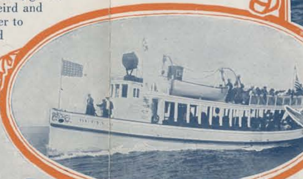
Motorship "Betty O" goes to the Isthmus and to Seal Rocks; also for evening searchlight trips