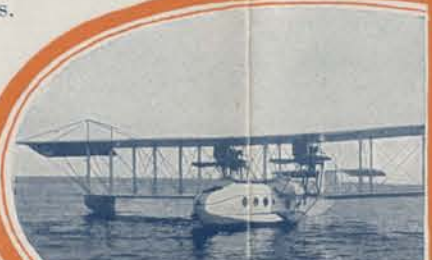
Flying Boats go to Catalina in 20 minutes

The Steamship "Avalon," large and with ample deck space, both open and enclosed, and the Steamships "Cabrillo" and "Hermosa" comprise the Island fleet for cross-channel passage.