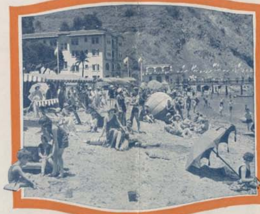
Hotel St. Catherine Beach was the scene of much of the activity in the great Paramount picture "Feet of Clay."

There are numerous other hotels, apartments and rooming houses at Avalon. A complete list will be furnished upon request.