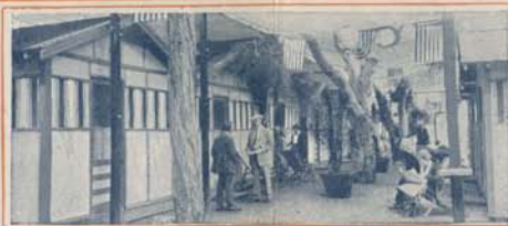
Island Villa and Villa Park, largest one-floor hotel in the world. 1250 one-room bungalows. European plan.

Hotel Atwater, one-half block from Steamer Pier. All outside rooms. European Plan.