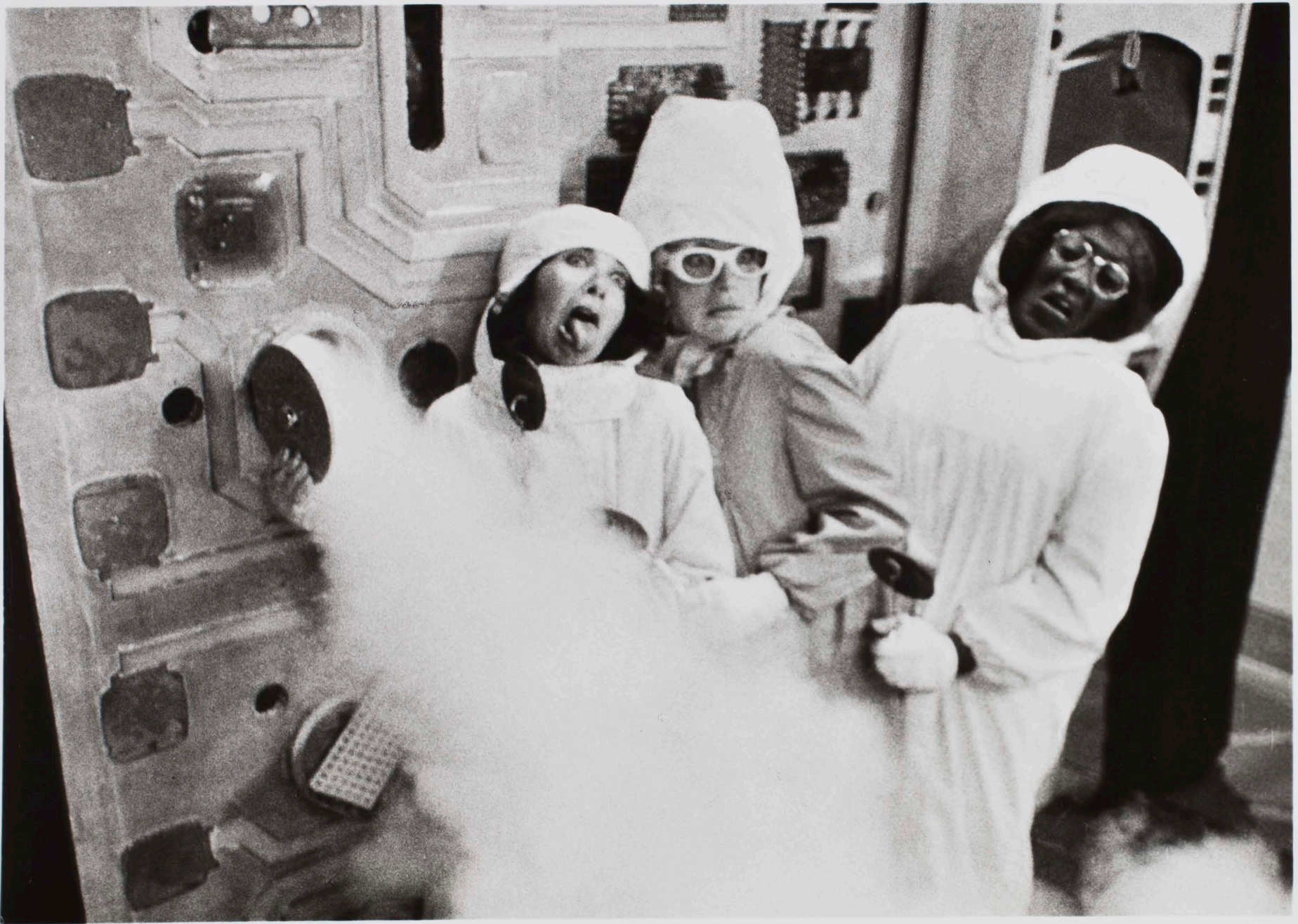
Three workers find the electronics assembly line is a gas in the San Francisco Mime Troupe's latest comedy, ELECTRO BUCKS .