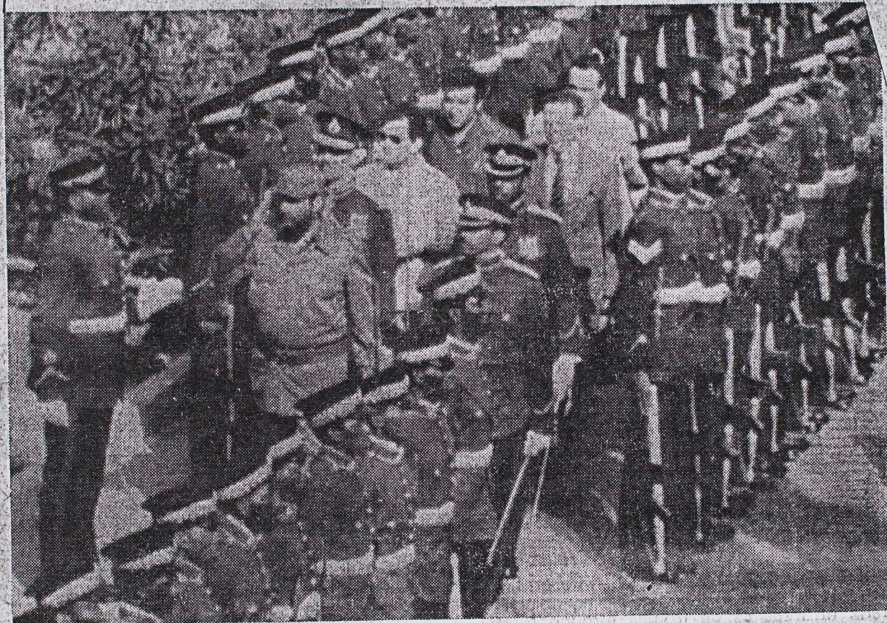
STATE VISIT —Cuban President Fidel Castro re-views troops in Kingston, Jamaica, during an STORY IN PART 1, PAGE 19

official six-day visit to the island. Opposition Jamaican party is protesting rally for Castro.