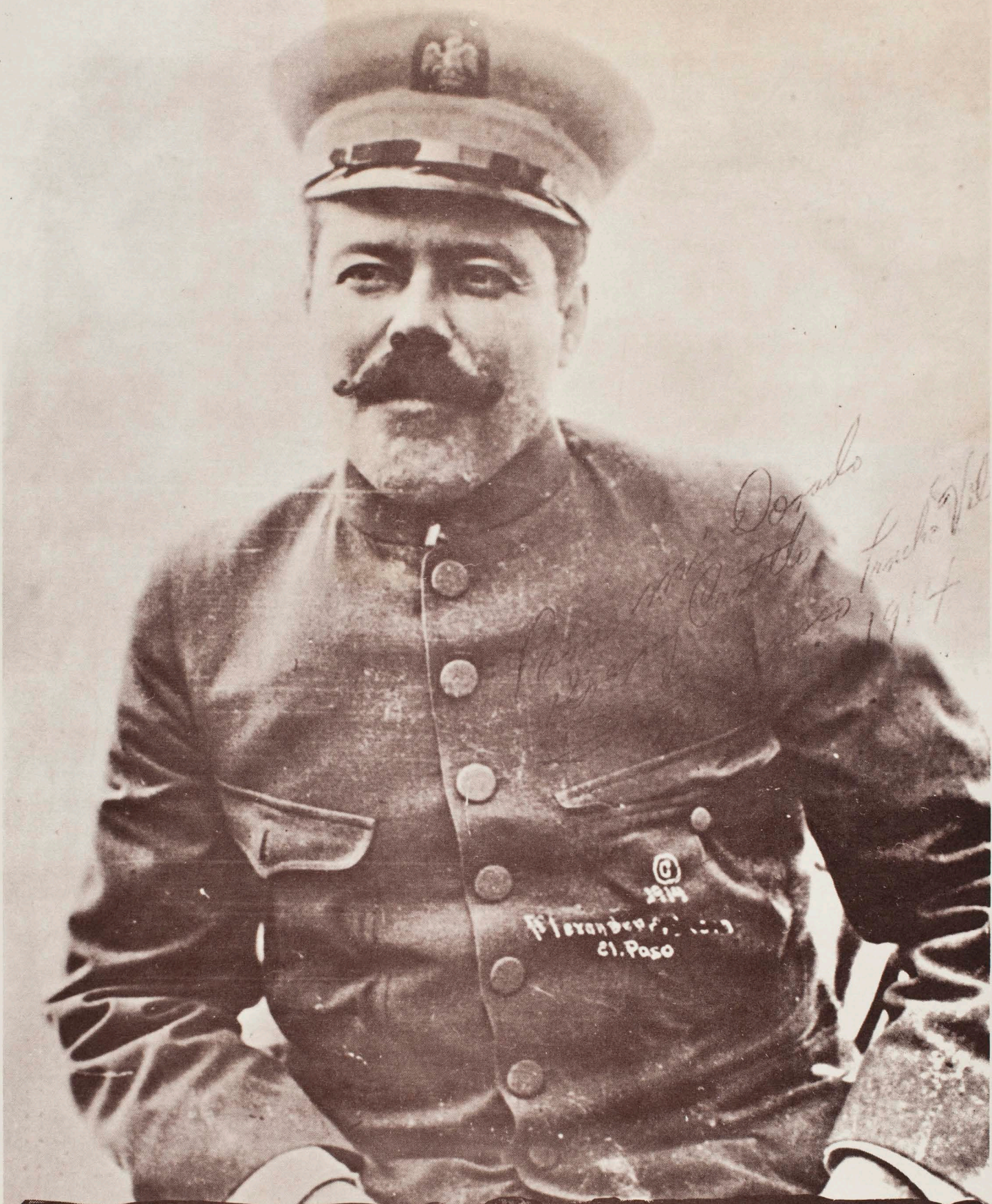
GENERAL FRANCISCO VILLA