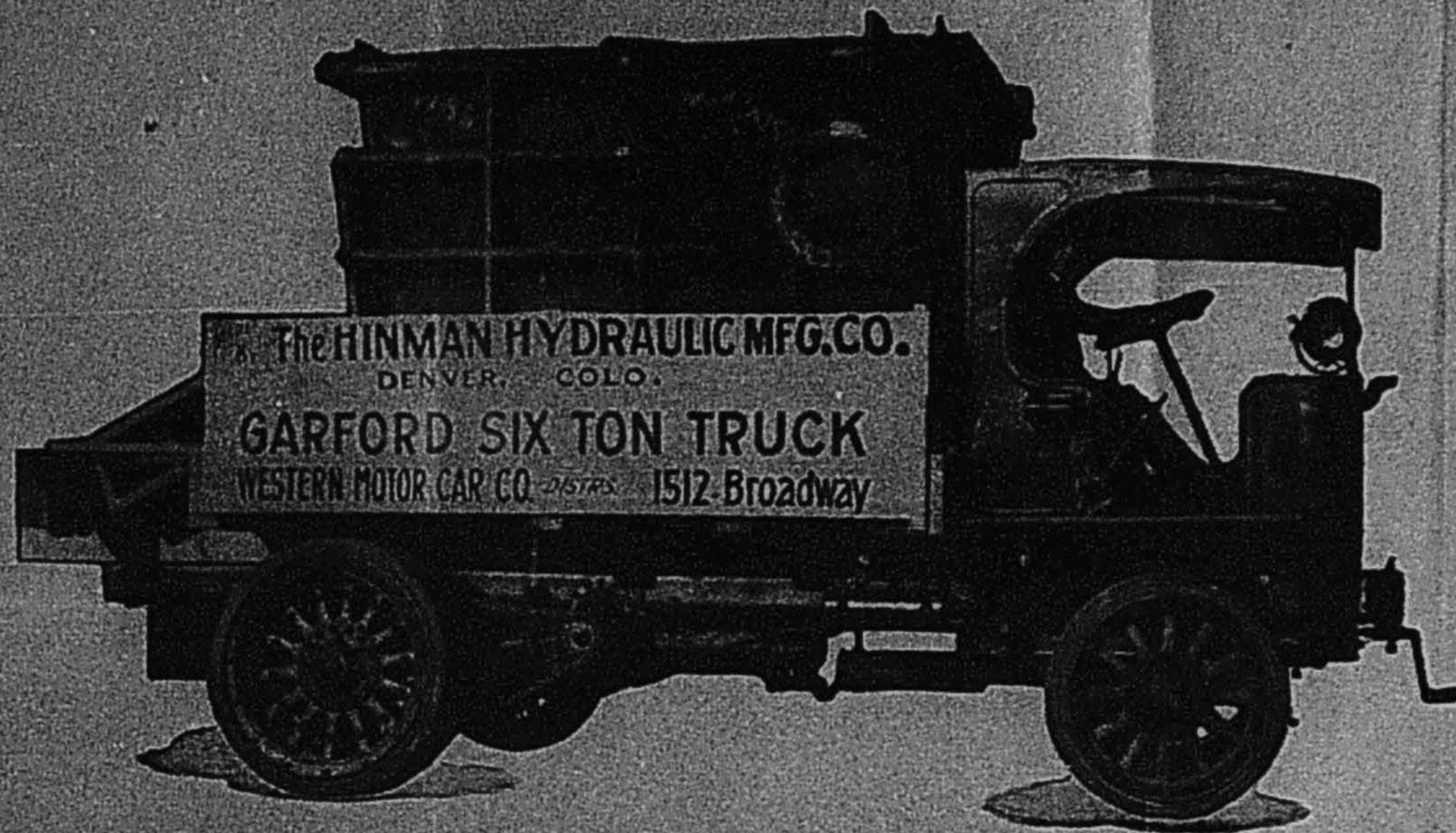
Part of the massive 300-ton water valve being built by the Hinman Hydraulic Mfg. company for the United States irrigation project at Elephant Butte dam in Texas. This section of the valve weighs 20,500 pounds and was photographed as it was borne through the streets on one of the powerful six-ton Garford trucks, of which the Western Motor Car company is distributor.