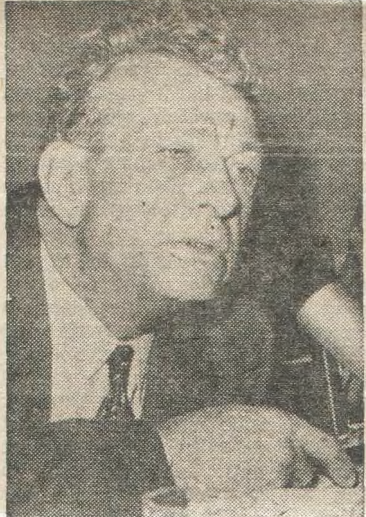
EVERETT M. DIRKSEN

But instead, the Subcommittee on Preparedness on several occasions called witnesses in closed session shortly before they appeared in open session before the other three committees. And Senator Goldwater of the Subcommittee called for a delay in final judgment of the treaty until it could make public its damaging evidence. This implication was clearly that the military thinkers of the Senate were able to drag from their witnesses new information which indicated dangers to our