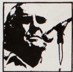
Bert Corona National Immigration Coalition