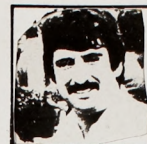
Armando Navarro Congreso Del Pueblo