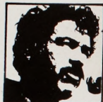
Corky Gonzales Crusade for Justice