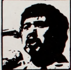
Herman Baca Committee on Chicano Rights