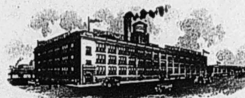
OFFICES & FACTORY - CHICAGO, ILL. 36 th STREET & JASPER PLACE.