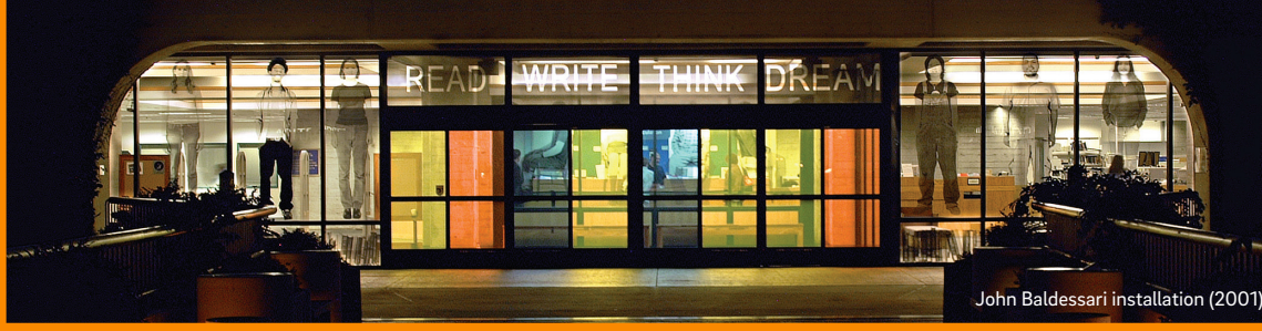
John Baldessari installation (2001)