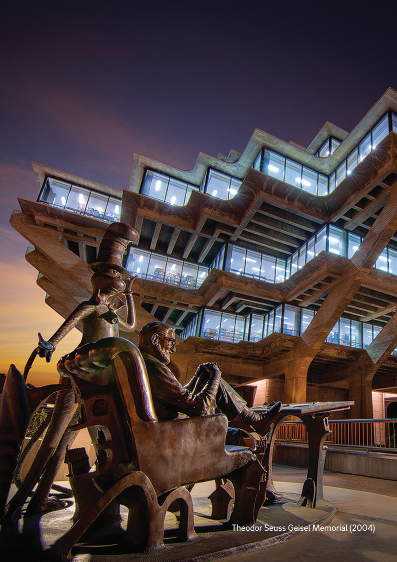
Theodor Seuss Geisel Memorial (2004)